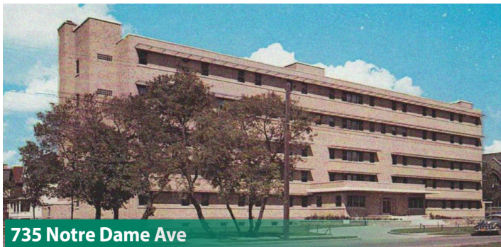
735 Notre Dame Ave

At a short event on Monday November 25, 2019 we bade farewell to 735 Notre Dame Avenue, taking time to celebrate and recognize the legacy of the current hospital and bless staff as they transition to the new facility.