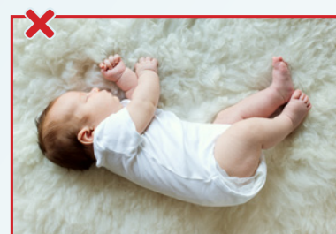
No sleeping on side