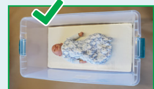
Bin (no lid)

For tips on making these temporary sleep spaces, and making a mattress, call your public health office or visit healthyparentingwinnipeg.ca .