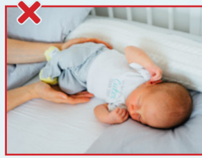
With a sleep positioner or bumper pads