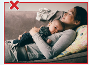
Sleeping with anyone on a sofa or chair