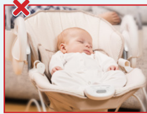
Infant seats, swings, strollers, sleep products that are inclined (not flat)