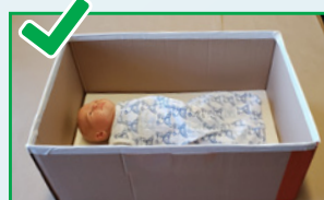
Box or Carton