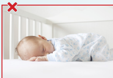
No sleeping on tummy