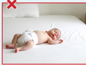
Alone on an adult bed