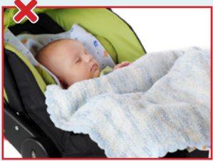
In a car seat or baby carrier