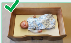
Drawer (not in dresser)