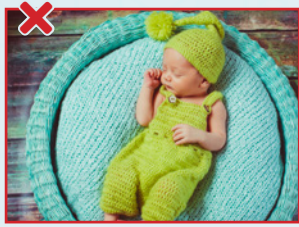
On soft surfaces such as a pillow or folded blankets.

Images with an ✗ are not safe sleep spaces. Sharing any sleep surface with your baby is unsafe.